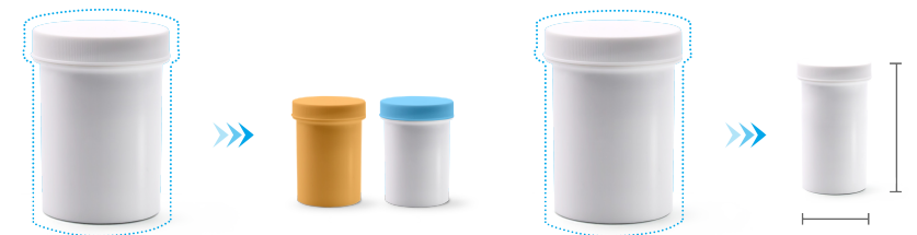
*Bottle cap and body colors are customizable.